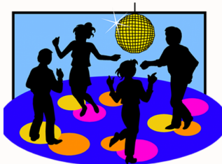
Attend a school disco