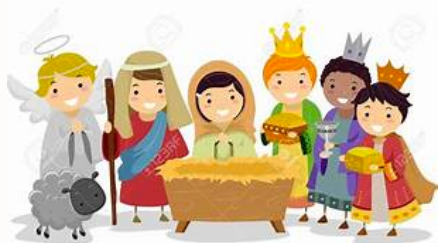
Participate in a Nativity