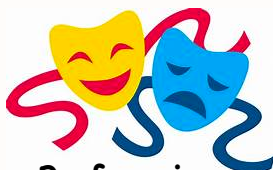
Perform in a Leavers' Play