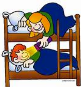
Attend a residential